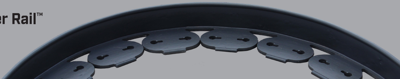
Flex Paver Rail™