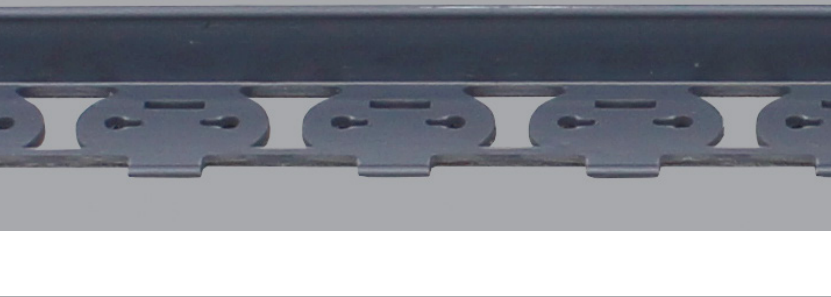
Low Profile Paver Rail™